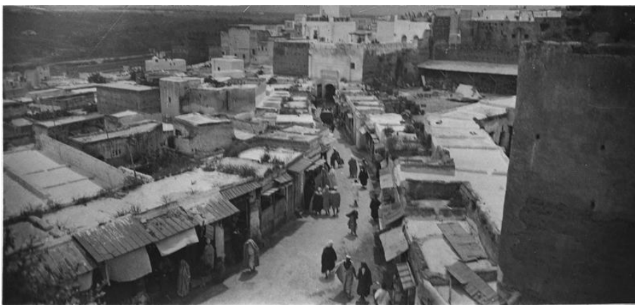
Paul Queste, Panoramic view of entrance to the Mellah, 1916.