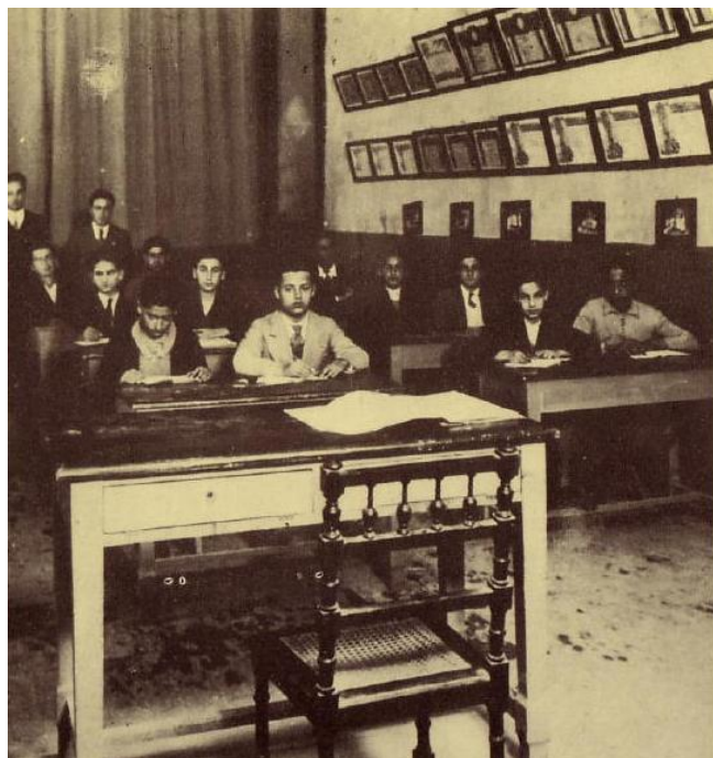
Libyan Jewish Classroom in Benghazi Synagogue, ca. 1930-1940.

What questions do these photos raise about Jewish education in pre-war North Africa?