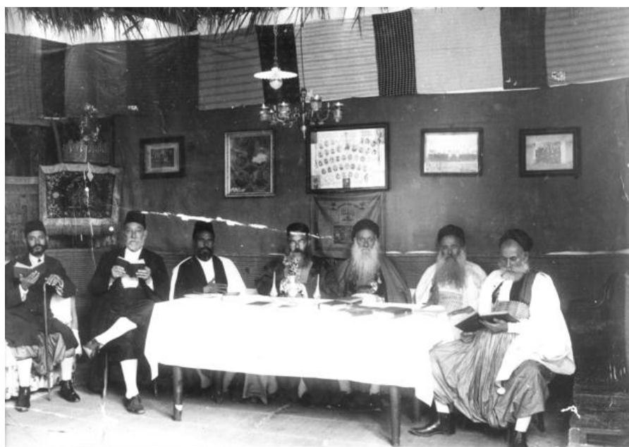
Jews from Libya Sitting in a Sukkah 1 , n.d.

What questions do these images raise about what Jewish worship looked like in pre-war North Africa?