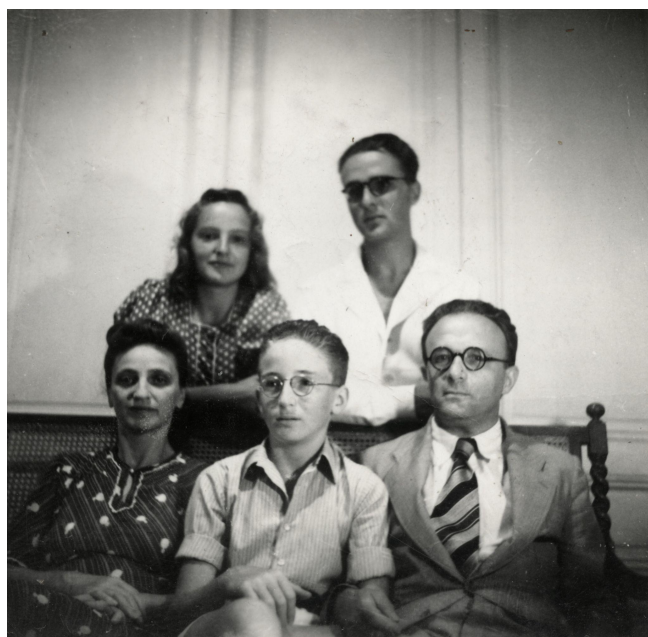
Portrait of the Beretvas Family in Their Home in Tunis, 1938.

What questions do these images raise about the types of clothes Jewish people chose to wear when posing for formal photographs?