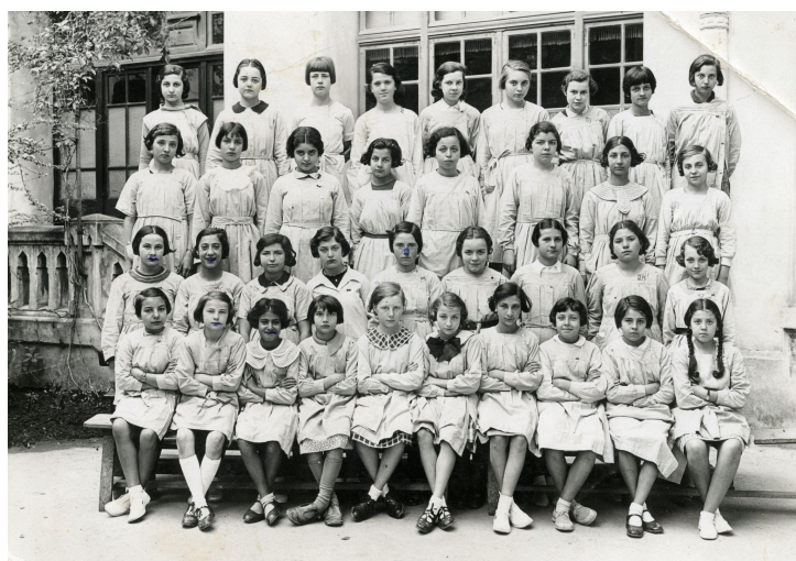
A Group of Tunisian School Girls, ca. 1930-1935.