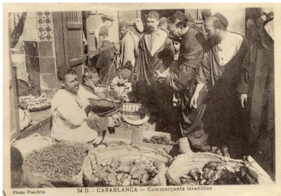
Israelite Traders, 1929.

What do you notice about some of the different roles Jews played in society?