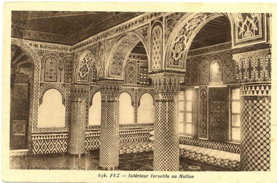
Interior of a Jewish home in the Mellah, 1915.

What might these images suggest about diversity in socio-economic status among the Jews of North Africa?